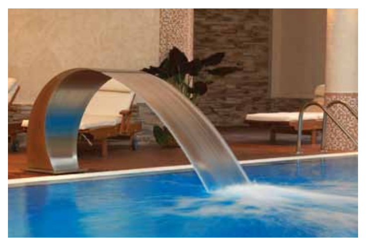
When it comes to moving more water faster and serving multiple features, you can count on the Challenger pump.